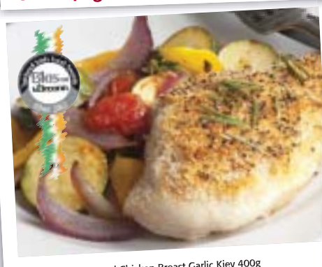
SuperValu Part Boned Chicken Breast Garlic Kiev 400g Supplier: Carton Brothers €5