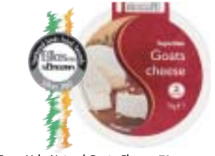
SuperValu Natural Goats Cheese 70g Supplier: Five Mile Town €1