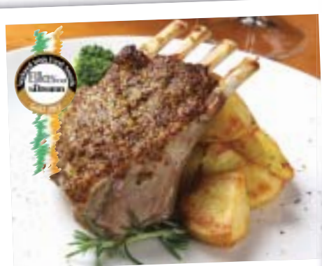
SuperValu Stuffed Lamb Rack with Redcurrant & Rosemary Stuffing Supplier: Kepak Ltd. €22.99/kg

To see more of our award winning products visit SuperValu.ie