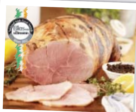
SuperValu Wiltshire Ham On The Bone Supplier: O'Brien Fine Foods €20.99/kg