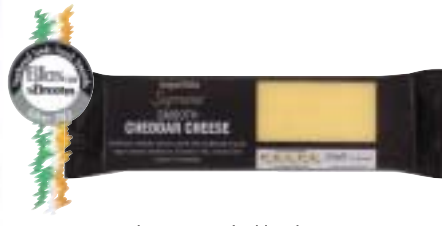
SuperValu Supreme Cheddar Cheese 200g Supplier: Bandon Vale €2.49