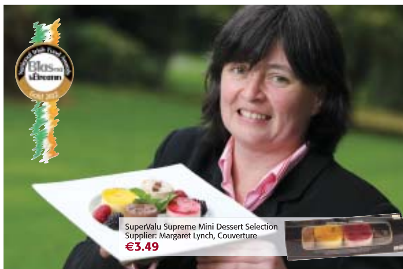
SuperValu Supreme Mini Dessert Selection Supplier: Margaret Lynch, Couverture €3.49