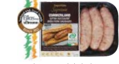
SuperValu Supreme Cumberland Pork Sausages 380g Supplier: Mallon's €2.99

SuperValu Part Boned Chicken Breast Garlic Kiev 400g €12.50/kg, SuperValu Supreme Cheddar Cheese 200g €12.45/kg, SuperValu Supreme Mash With Carrot & Turnip 300g €11.63/kg, SuperValu Supreme Billionaires Dessert 160g €21.81/kg, SuperValu Natural Goats Cheese 70g €14.29/kg, SuperValu Honey 340g €4.38/kg, SuperValu Supreme Traditional Pork Sausages 380g €7.87/kg, SuperValu Supreme Cumberland Pork Sausages 380g €7.87/kg, SuperValu Supreme Christmas Pudding 908g €9.91/kg. Offers available in selected stores only. Offers valid from 28/10/12 – 03/11/12.