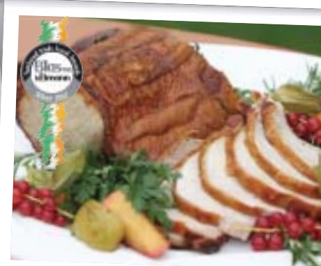
SuperValu Smoked Pork Loin Roast Supplier: Oliver Carly Ltd. €10.59/kg