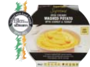
SuperValu Supreme Mash With Carrot & Turnip 300g Supplier: Country Crest €3.49