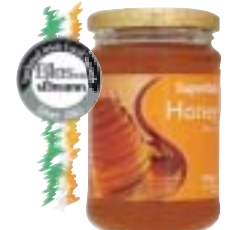
SuperValu Honey 340g Supplier: Healy's Honey €1.49