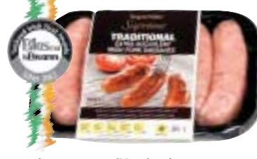
SuperValu Supreme Traditional Pork Sausages 380g Supplier: Mallon's €2.99