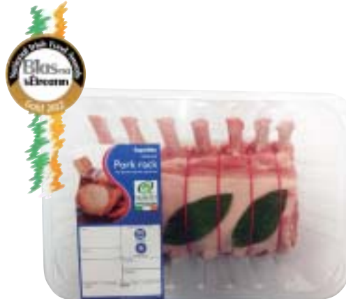
SuperValu Pork Rack With Sage & Bramley Apple Butter Supplier: Kepak Ltd. €9.99/kg